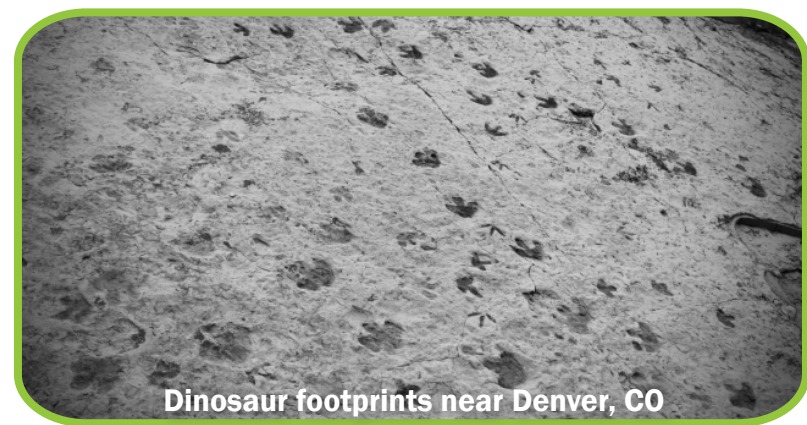
Dinosaur footprints near Denver, CO

Some dinosaurs are not found together with fossils of their food. Grass-containing dinosaur coprolites from India show that some dinosaurs ate grass. However, other than coprolites, grasses appear only in rocks above dinosaur-containing layers. The fossil record is ordered, but the order doesn’t necessarily indicate when organisms lived. If it did, dinosaurs and their food should appear together.