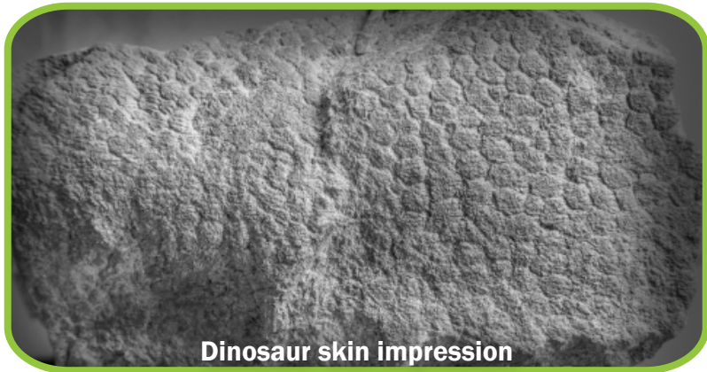
Dinosaur skin impression

Some dinosaurs had alligator-like skin. Sometimes, impressions of dinosaur skin were left in mud and preserved as fossils. These impressions show that at least some dinosaurs had hard scaly skin, but not the kind of overlapping scales found on snakes or lizards.