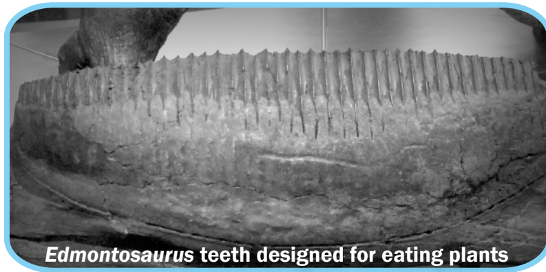
Edmontosaurus teeth designed for eating plants